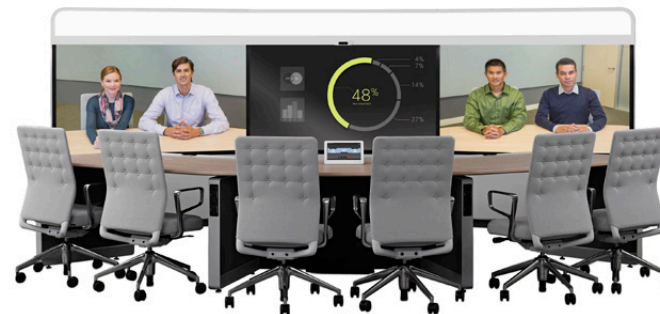
Cisco TelePresence® IX5000 system brings a global company face-to-face.

But how do you ensure that you choose the right technology and that the environment you design will truly create a workplace that current and future generations will embrace, utilize, and thrive within?